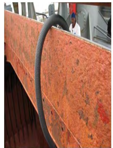
A connection is made between the manway opening and the bottom and top of the cargo hold.