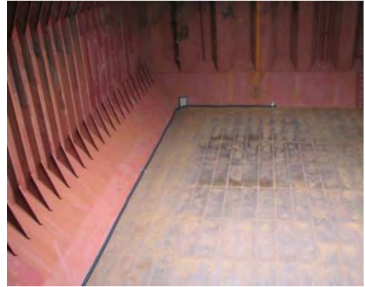
Plastic tubing is taped to the perimeter of the cargo hold.