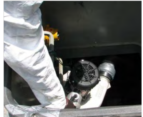
A blower is attached to the J-System® tubing inside the manway opening allowing high fumigant concentrations from the surface of the cargo to be forced to the bottom of the cargo hold.